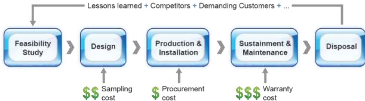
Fig. 1 - Product life cycle showing important costs for switching solutions

Fig. 1 shows three costs associated with a switching solution at different times. “Sampling cost” could be related to the purchase cost of a small quantity of the switching solution under consideration plus the lead time to obtain such samples for prototyping and trade off studies. “Procurement cost” is thought of as the initial purchase cost of a chosen switching solution after negotiations involving forecast and contractual terms. “Warranty cost” may occur during the last and longest phase of the life cycle and are highly dependent of the business model implemented for each company. More details about costs and how to account for them are presented in subsequent sections leading to a new paradigm where Solid State Relays may be considered more cost effective than other switching solutions.